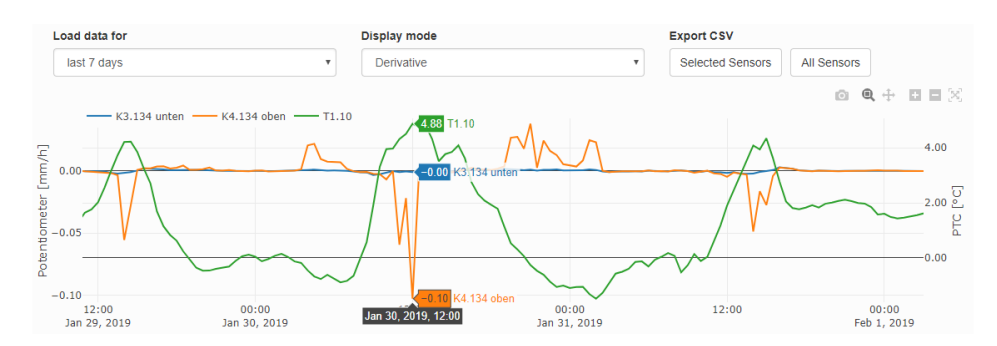
Figure 3: Displacement speed in mm/h and temperature in °C

Export of measurement results as a .csv file for further evaluations.