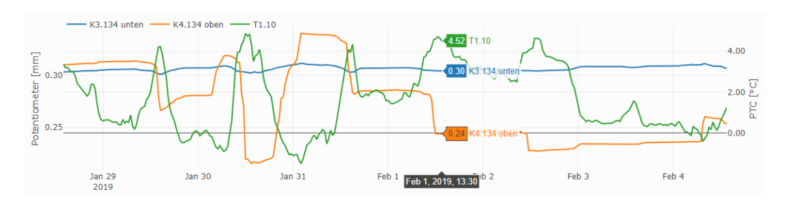
Figure 2: Displacements in mm and temperature in °C

If several sensors are selected, the graphic scale is expanded accordingly. It is possible to display measured values with regard to a 2nd axis (e.g. the temperature).