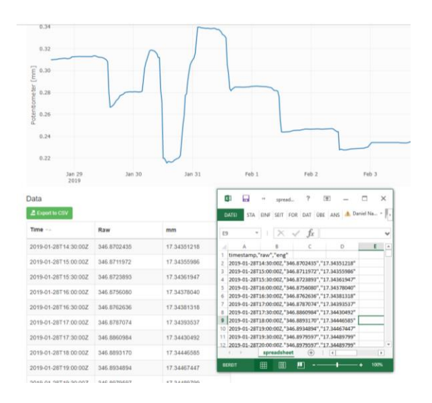
Figure 4: Table of values (either raw and engineering units)

Export of measurement results as a .csv file for further evaluations.